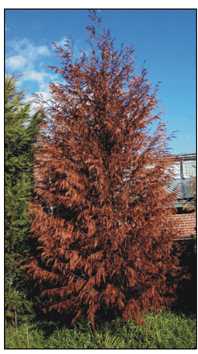
Figure 6. Tree killed by Phytophthora root rot.

Decayed, darkened roots are a symptom of the disease; however, Phytophthora root rot can only be diagnosed with certainty by laboratory analysis