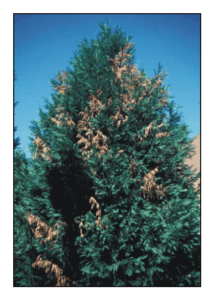
Figure 3. Branch dieback symptoms of Seiridium canker.

Sanitation, such as removal of cankered twigs