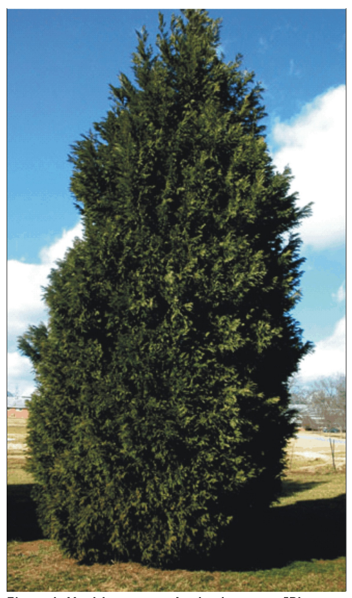
Figure 1. Healthy, mature Leyland cypress.

In Georgia, Seiridium canker is probably the most important and destructive disease on Leyland cypress in the landscape. Although the fungi Seiridium cardinale, Seiridium unicorne, and Seiridium cupressi have been reported to cause disease on Leyland cypress and other needled evergreens, only Seiridium unicorne is most commonly associated with cankers and twig dieback on Ley-