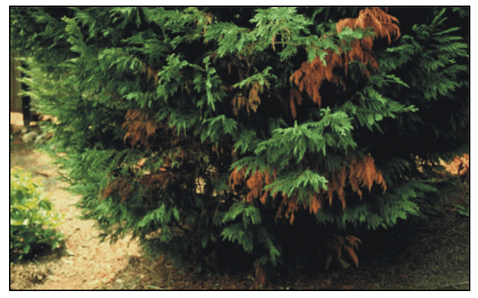
Figure 5. Dark, rust-colored dieback symptoms of Botryosphaeria (Bot) canker. the canker as it grows.

In the landscape, Bot canker symptoms resemble those caused by Seiridium canker. Bright, rust-colored branches and yellowing or browning of shoots or branches are the first observed symptoms. Closer inspection reveals the presence of sunken, girdling cankers at the base of the dead shoot or branch. Sometimes, the main trunk shows cankers that might extend for a foot or more in length. These cankers rarely girdle the trunk, but they will kill branches that may be encompassed by