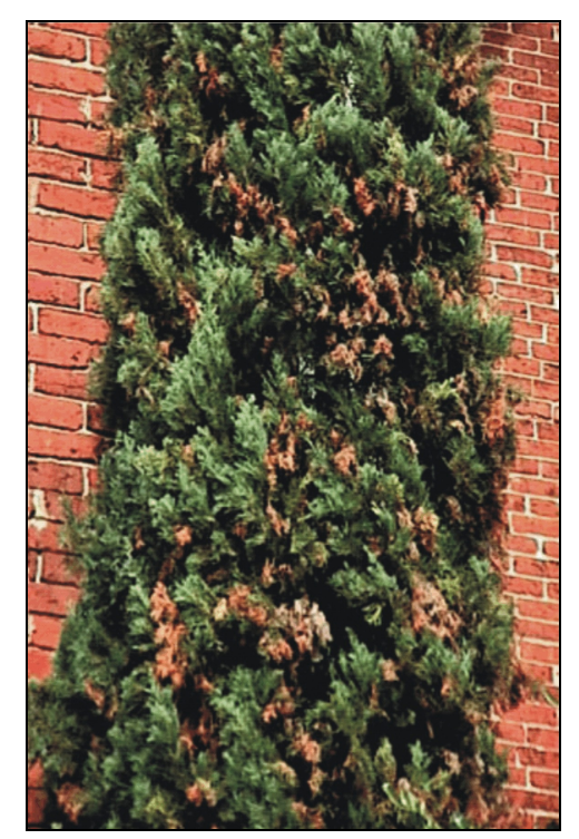
Figure 2. Branch and twig dieback symptoms of Seiridium canker.

oration is most likely to appear in early spring; however, it can be seen at any time of the year. The disease expansion often continues until a significant portion of the tree is destroyed. Upon closer examination, formation of numerous thin, elongated cankers is observed on stems, branches and branch axils. These cankers cause twig and branch dieback. Most of the cankers are slightly sunken, with raised margins, and they may be discolored dark brown to purple. Cracked bark in infected areas is often accompanied by extensive resin exudates that flow down the diseased branches. The cambial tissue beneath oozing sites is discolored with a reddish to brown color.